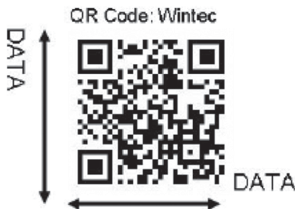
Figure 1: Sample QR Code (Savarani & Clayton, 2009).